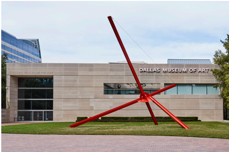
Dallas Museum of Art Friday Night's Reception