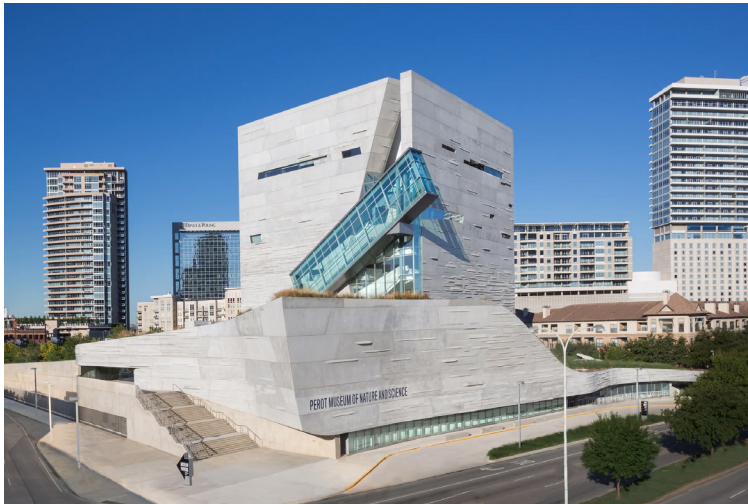
Perot Museum of Nature and Science Wednesday's Welcome Reception