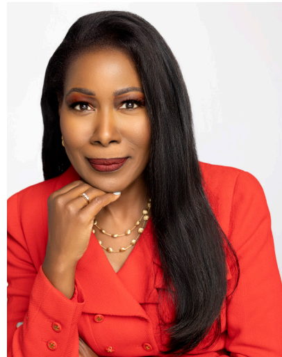
Isabel Wilkerson New York Times Best Selling Author and Pulitzer Prize Winner