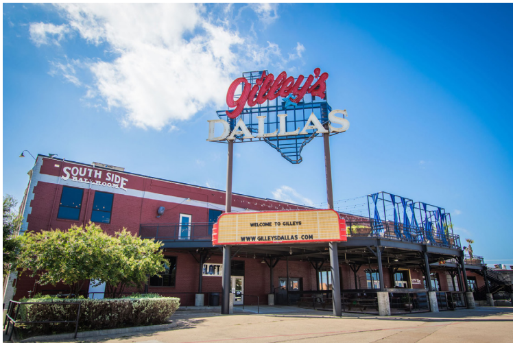
Gilley's Dallas Saturday Night's Reception